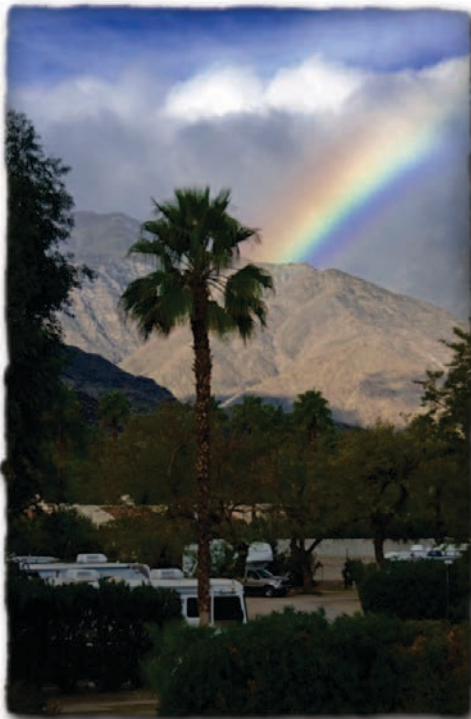
We're at the end of the rainbow!

chores. You'll see our new color scheme in one of the pictures accompanying this article.