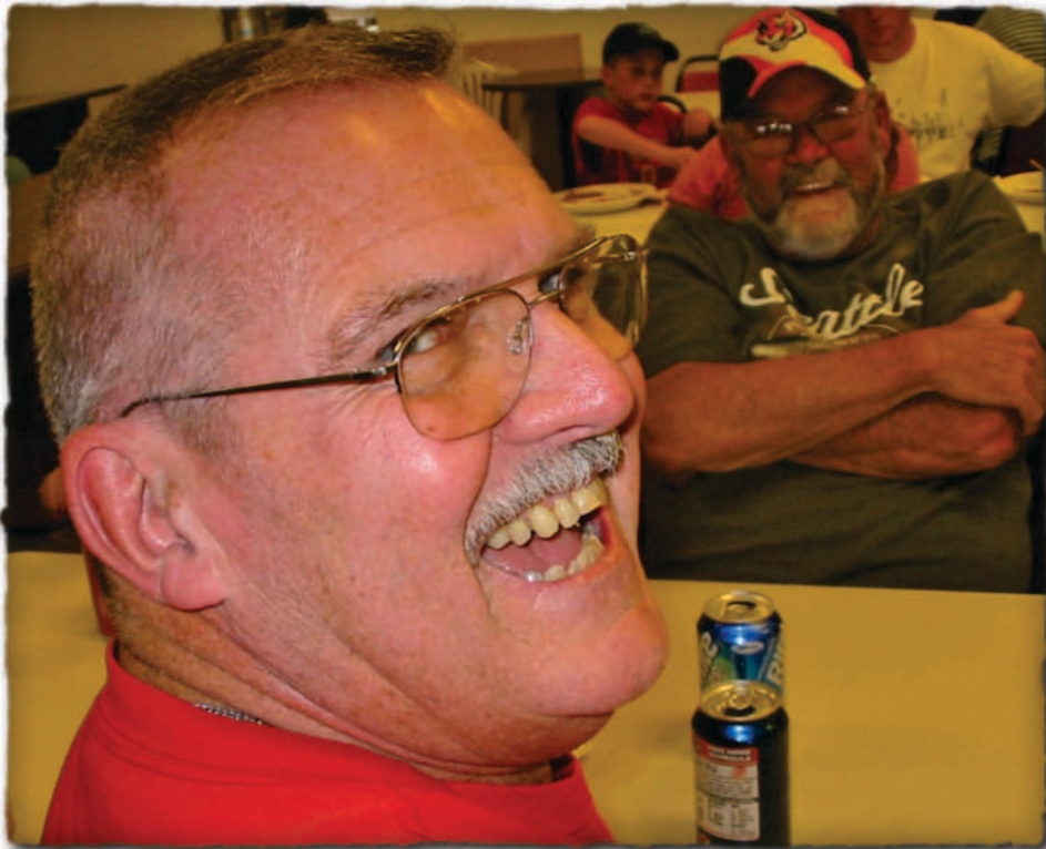
It's all about fun and smiles at Tomorrow's Stars

from the winter we just went through. But I also think some of it is the unrest the whole world is going through. Maybe we just need to get away with our families and friends to enjoy life and meet