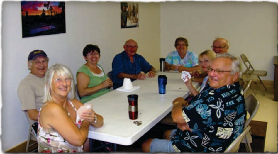
Thursday nights have become Game Night in the clubhouse at Cathedral Palms.

working to ready the campground for another season. Summer is the time when we paint and take care of other maintenance