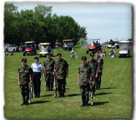
We're looking forward to a return of the ROTC drill team