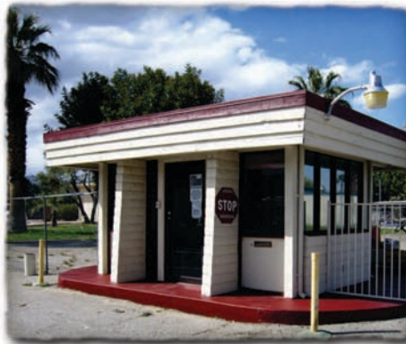
Our new paint scheme on the security building at entrance

Many of our Winter guests have stayed on a bit longer than usual this year; some because they were having way too much fun and others