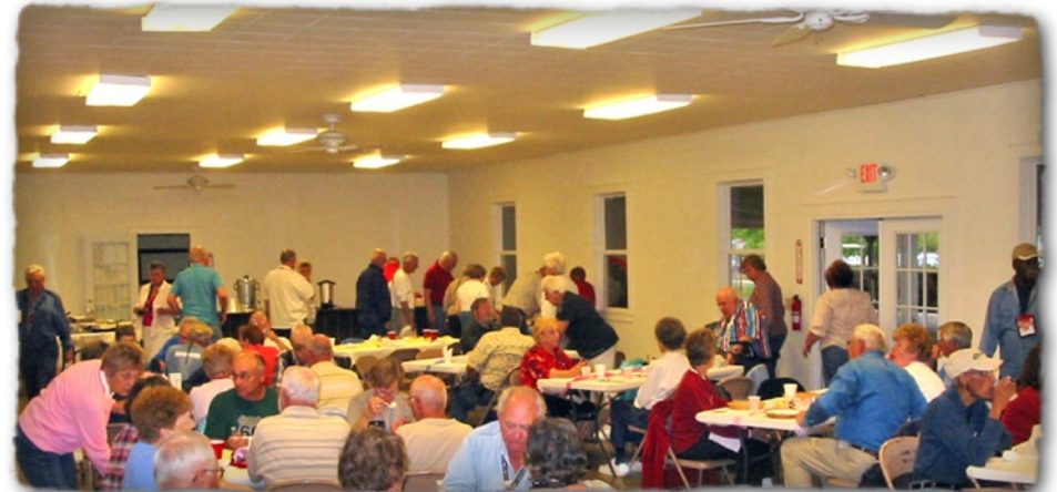
FMCA Amish dinner held in our new Clubhouse