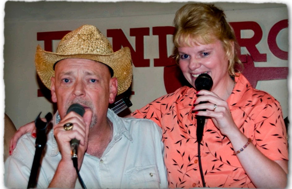
Road Work returns to the Red Garter on May 22

One of our favorite Country bands, Road Work, is scheduled for two appearances in the Red Garter Restaurant; the first is Saturday, May 22 and the second is Saturday, June 12. Cover charge will be just $5.00.