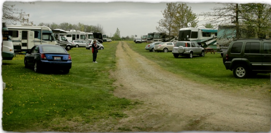
FMCA held their Rally here in late April

In late April, Tomorrow's Stars hosted the Midwest Coachmen Chapter of the Family Motor Coach Association, a worldwide organization with Chapters all over the United States. We were able to provide 33 closely adjoining sites for their community pleasure. Their beautiful motor homes collectively formed an "RV Park" within an RV park. Their camaraderie and good spirits made us feel as if we were doing everything right. They had a wonderful meal catered by a local Amish restaurant in our new clubhouse. You couldn't help feeling this group was having fun. If you own a motor home and are interested, more information can be found at www.fmca.com .